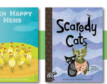
Scaredy Cats Combinations to Ten